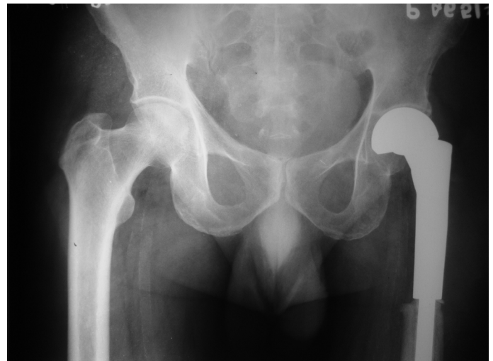
[Table/Fig-3]: X-ray pelvis with both hips AP-view showing replacement of left proximal femur with megaprotheses (immediate postoperative radiograph).