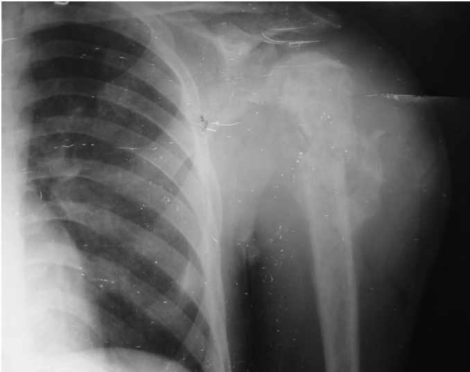
[Table/Fig-6]: X-ray left shoulder AP-view showing osteosclerotic lesion in proximal humerus with pathological fracture, ill-defined radiolucencies and marked soft tissue shadow.