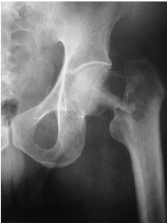
[Table/Fig-2]: X-ray left hip AP-view showing an expansile lytic lesion in neck and metaphyses of left femur with pathological fracture.