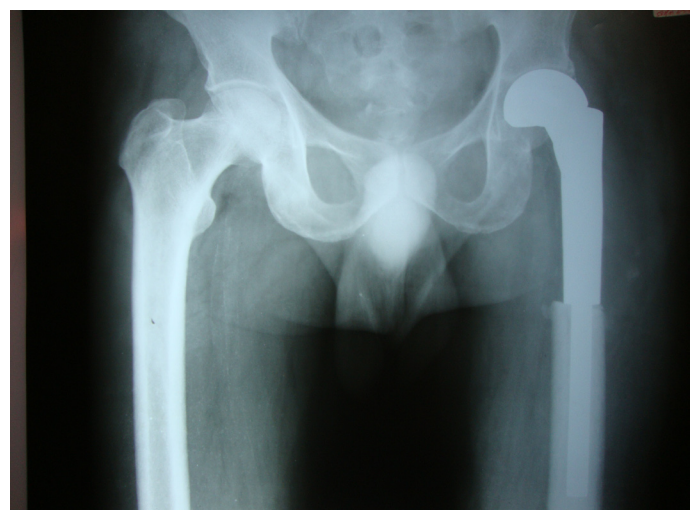
[Table/Fig-4]: X-ray pelvis with both hips AP-view at 18 months follow-up showing well seated megaprotheses in-situ with no evidence of recurrence.