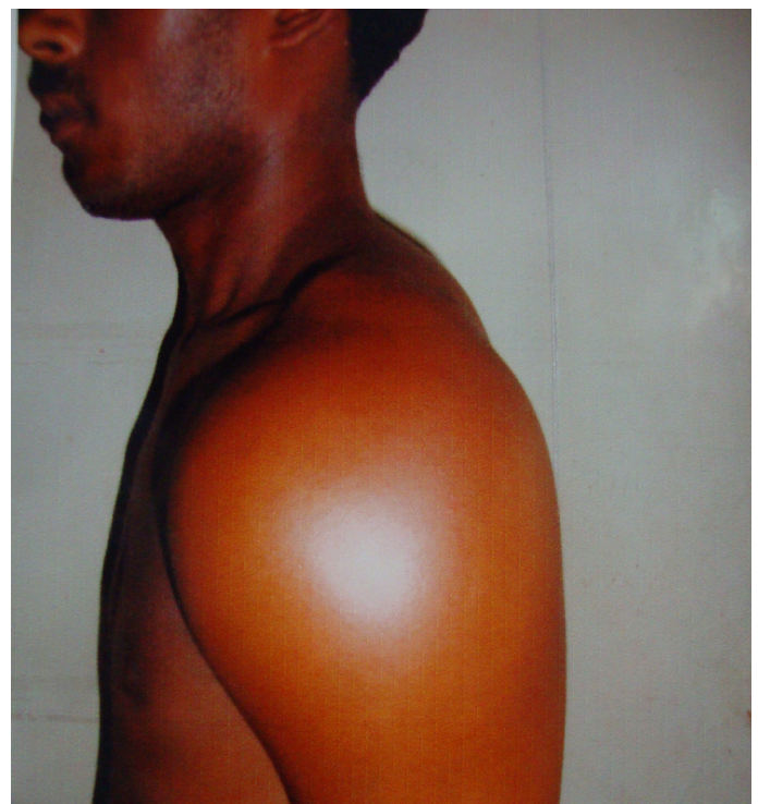
[Table/Fig-5]: Clinical photograph of patient showing diffuse swelling around left shoulder girdle.