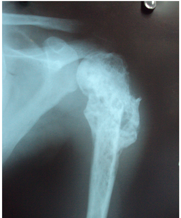
[Table/Fig-9]: X-ray left shoulder AP-view at 12 months showing united pathological fracture, sclerosis of proximal humerus with mineralization of radiolucencies.