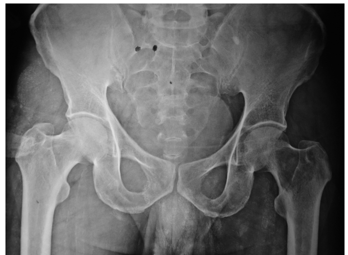
[Table/Fig-1]: X-ray pelvis with both hips AP-view showing an expansile lytic lesion in neck and metaphyses of left femur without any periosteal reaction.

reaction and adjacent cortical thinning, which were suggestive of metastasis/an osteogenic tumour. The myeloma study was negative. The biopsy report was suggestive of a lymphoproliferative disorder which involved the bone. The patient was admitted to our hospital with a pathological fracture [Table/Fig-2] which was sustained by a trivial fall. He was operated on with resection of the proximal femur and reconstruction of the defect by using megaprotheses [Table/Fig-3]. The tissue was sent for a histopathological examination. The final pathologic diagnosis was a primary lymphoma- NHL, diffuse large B-cell type of the proximal femur. Postoperatively, the patient received chemotherapy which consisted of cyclophosphamide, adriamycin, vincristine, and prednisone (CHOP). After 18 months of the operation, there has been no relapse either clinically or radiologically [Table/Fig-4]. The present case agreed with the literature on primary bone lymphoma, in which the diagnostic problem, a trauma-related presentation and an excellent prognosis of a malignant tumour have been emphasized.